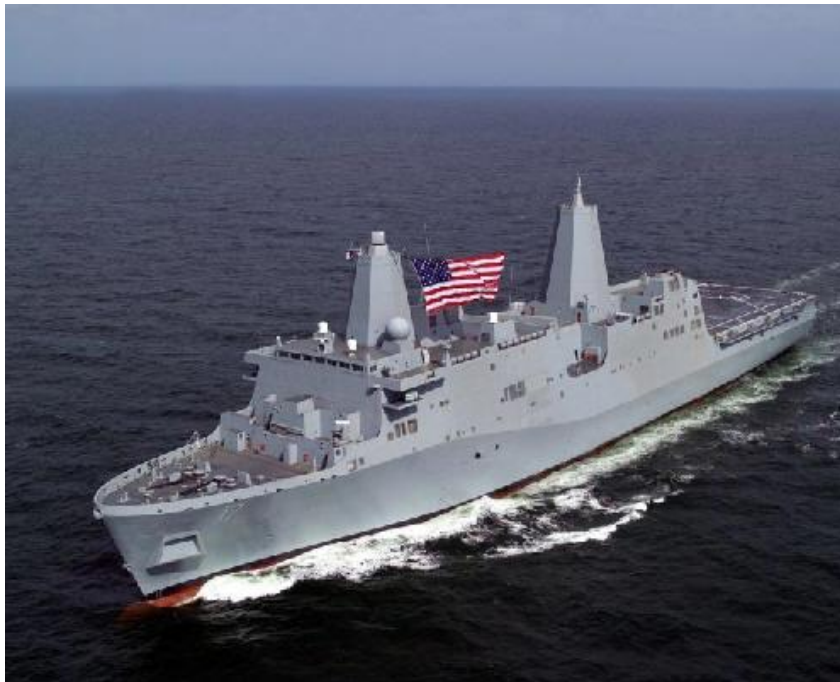
Artists Rendering of the USS New York

With a year to go before it even touches the water, the Navy's amphibious assault ship USS New York has already made history. It was built with 24 tons of scrap steel from the World Trade Center.