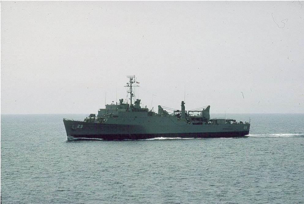
Plymouth Rock (LSD-29), Chesapeake Bay, July 1964, Navy Archives