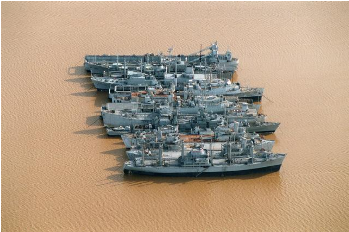
One of the last pictures of the USS Plymouth Rock taken in James River, VA on 28 January 1996. The Plymouth Rock is the first LSD in line from the top, next to her is the USS Donner (LSD20) and the Fort Snelling (LSD30)