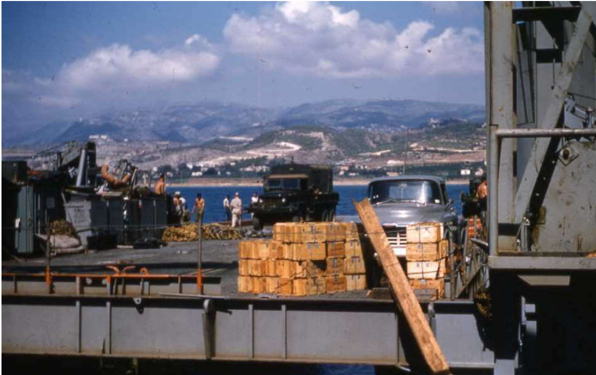
Ships flight deck loaded with cargo, notice the ships pickup.